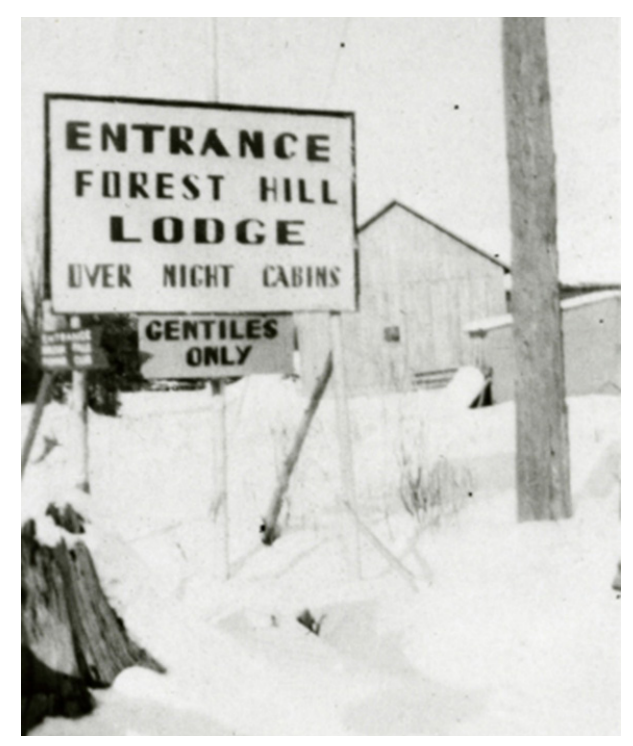
Sign noting that a lodge is open to gentiles (non-Jews) only. Ontario, Canada, 1940.