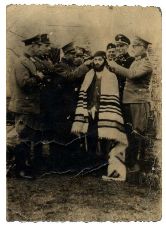
German army officers cutting the hair of a Jewish man in Poland, 1943.

Identity card for a Jewish man in the Netherlands, 1941.