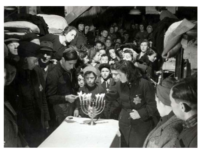
Lighting of Hanukkah candles in the Dutch transit and internment camp Westerbork. Netherlands, 1942.