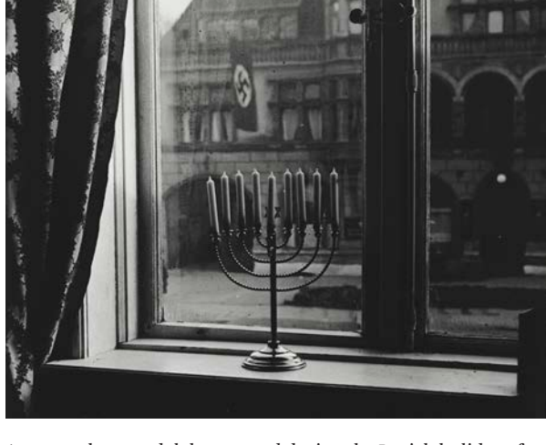
A menorah, a candelabrum used during the Jewish holiday of Hanukkah, rests on the sill of an apartment window in Kiel. Germany, 1932.

Step 4: Instruct students to answer the journal question for this lesson on Worksheet 1: Reflection Journal.