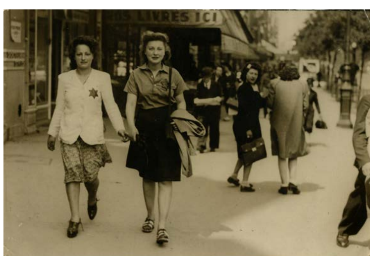
Two Jewish women wearing the yellow star in France, 1942.